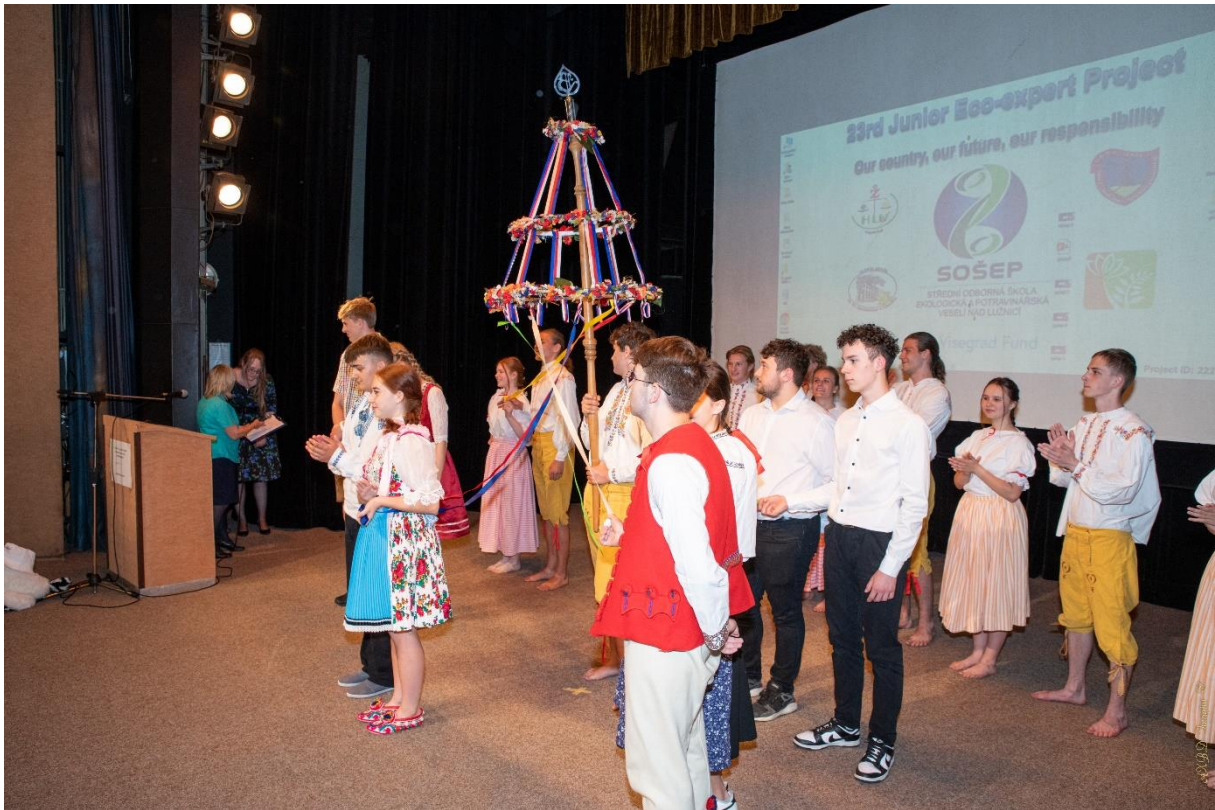
End of the project - representatives of partner schools on stage