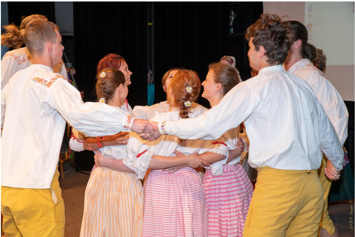
Czech Cultural Performance