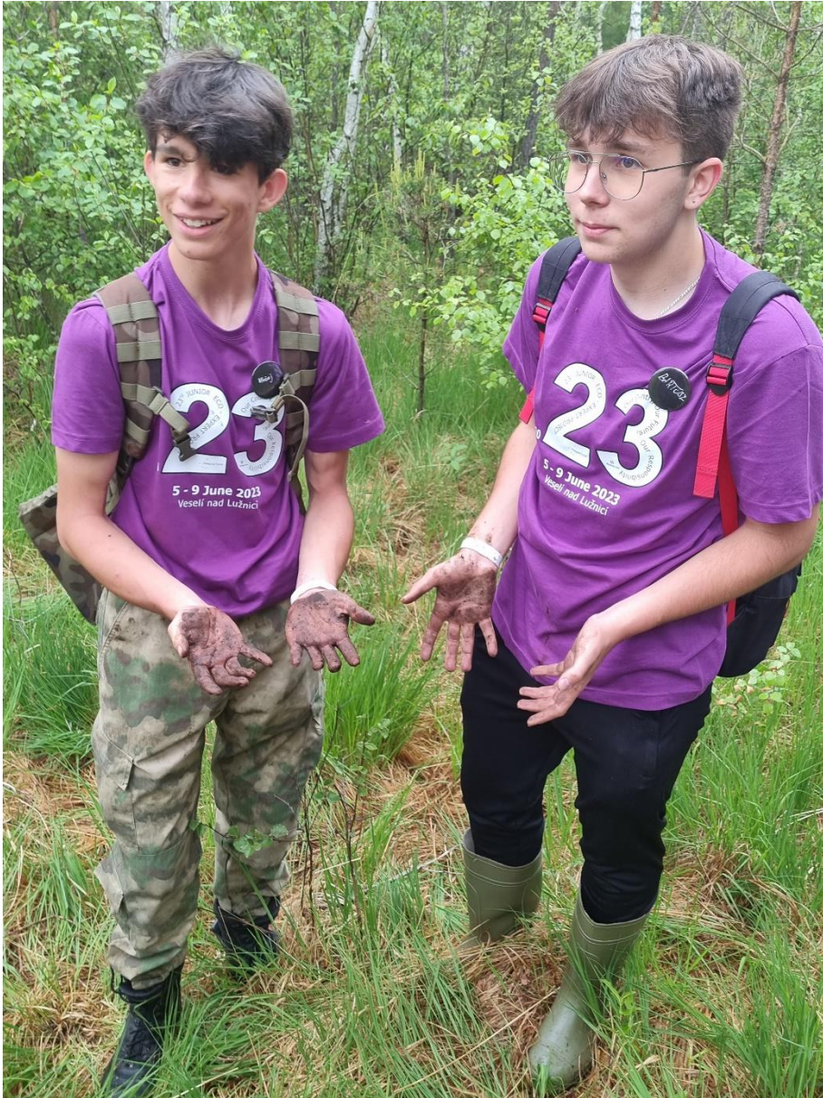
Borkovice moor 2