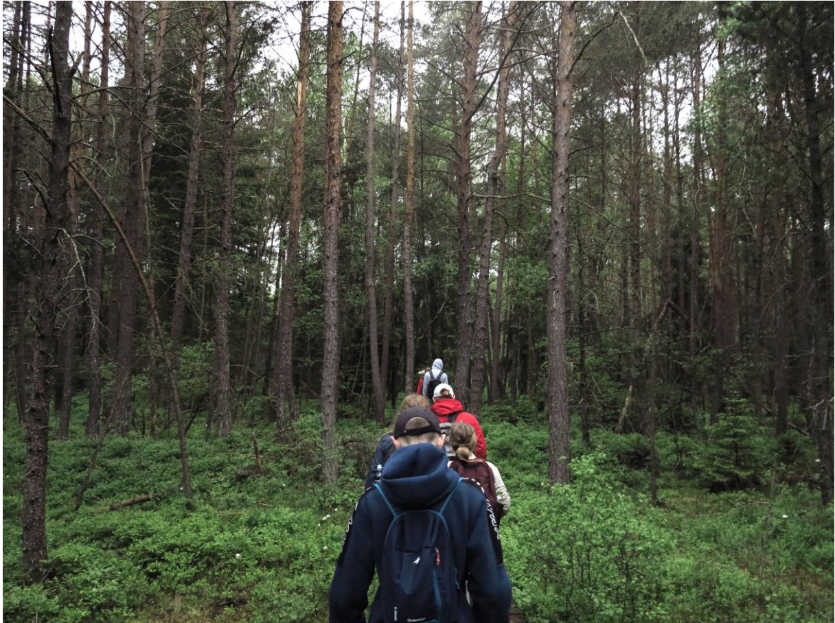
Borkovice moor 4

The fourth group went among the local ponds, where they devoted themselves to monitoring birds in the landscape, the influence of ponds on the landscape and the influence of man on the landscape.