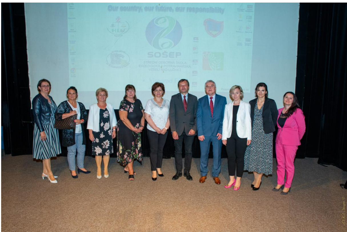
VIP quests – headteachers of participating schools and their accompaniment