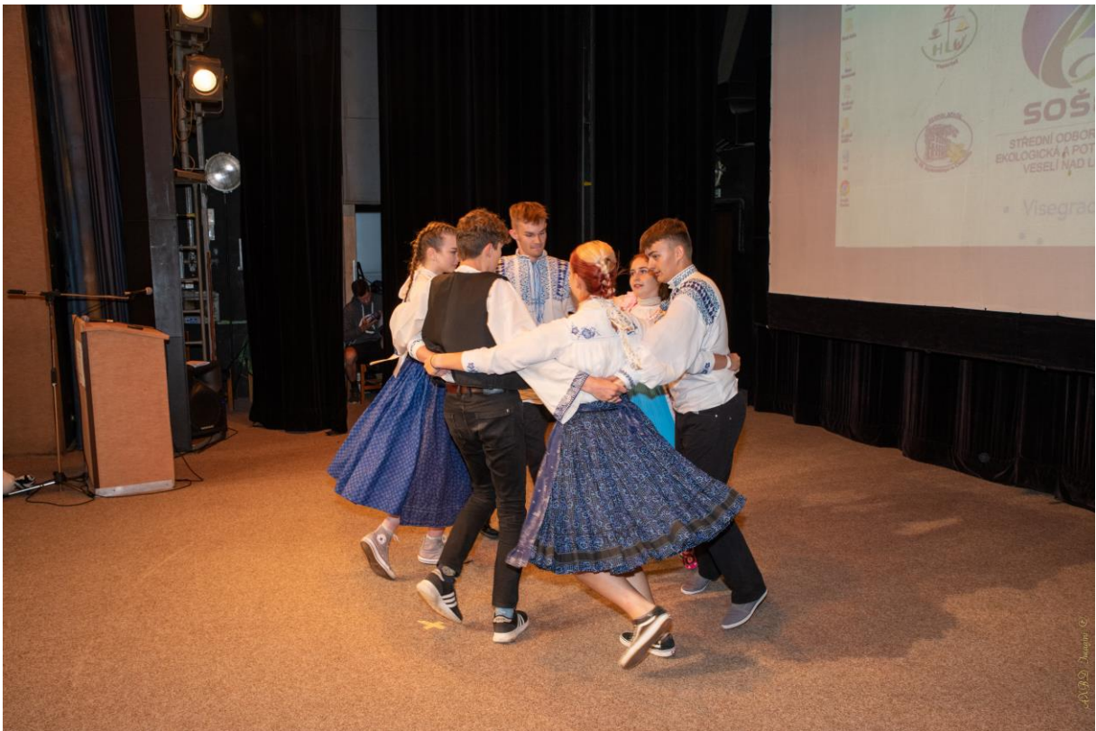
Slovak Cultural Performance