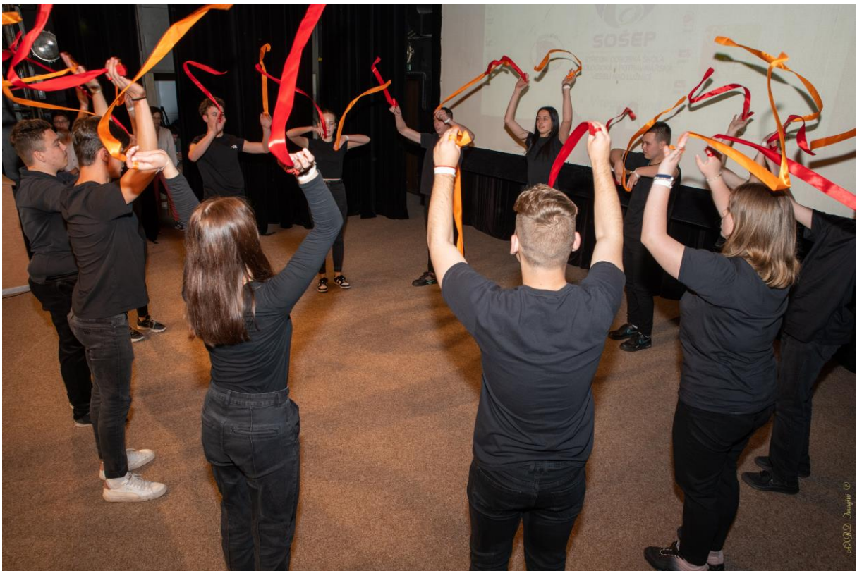
Hungarian Cultural Performance