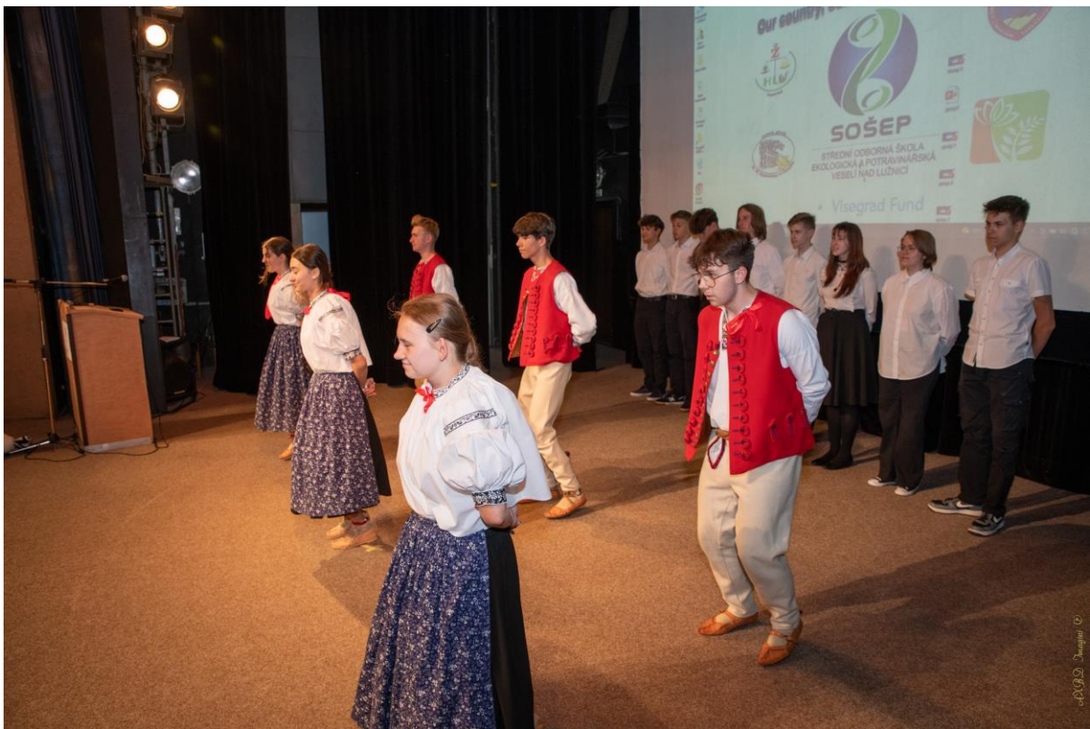
Polish Cultural Performance