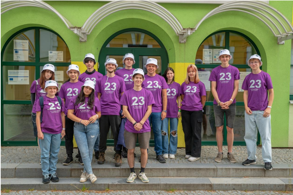
GROUP 3: Phytocenology and biodiversity