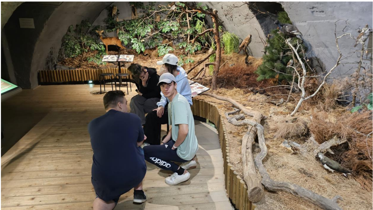
The House of Nature