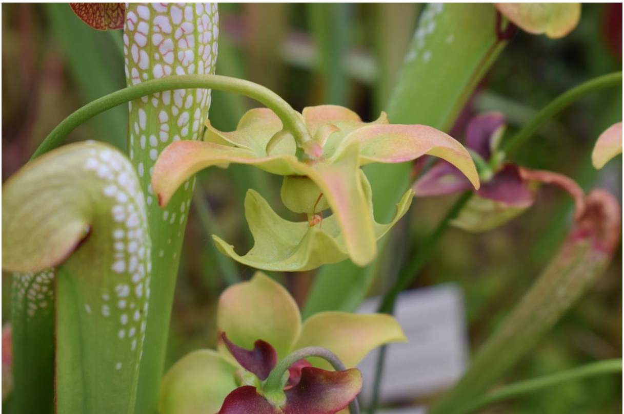
The Botanical garden 1