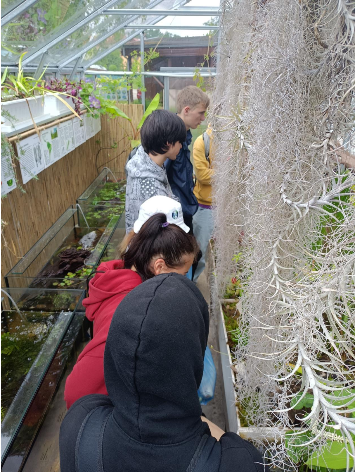
The Botanical Garden 5