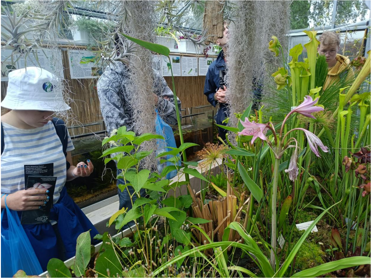
The Botanical Garden