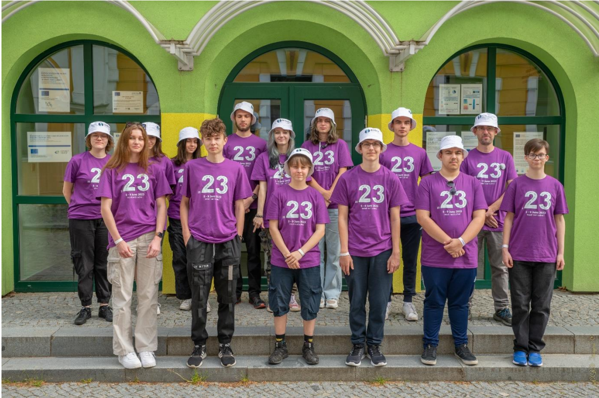
GROUP 4: Fishing systems and their importance in the landscape