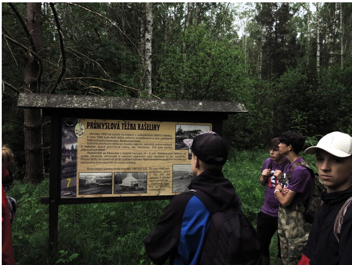
Borkovice moor 3