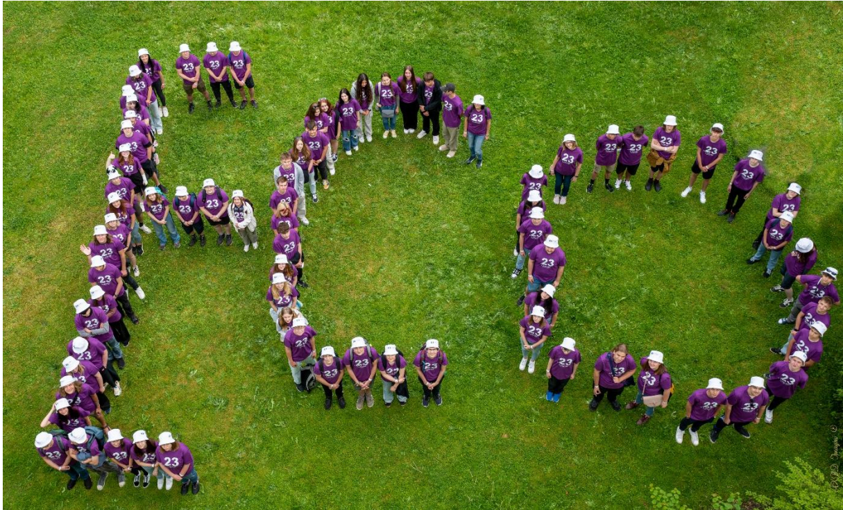
Eco – all participants