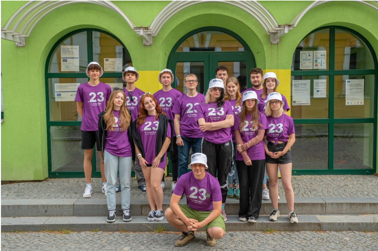
GROUP 5: Water and pond systems