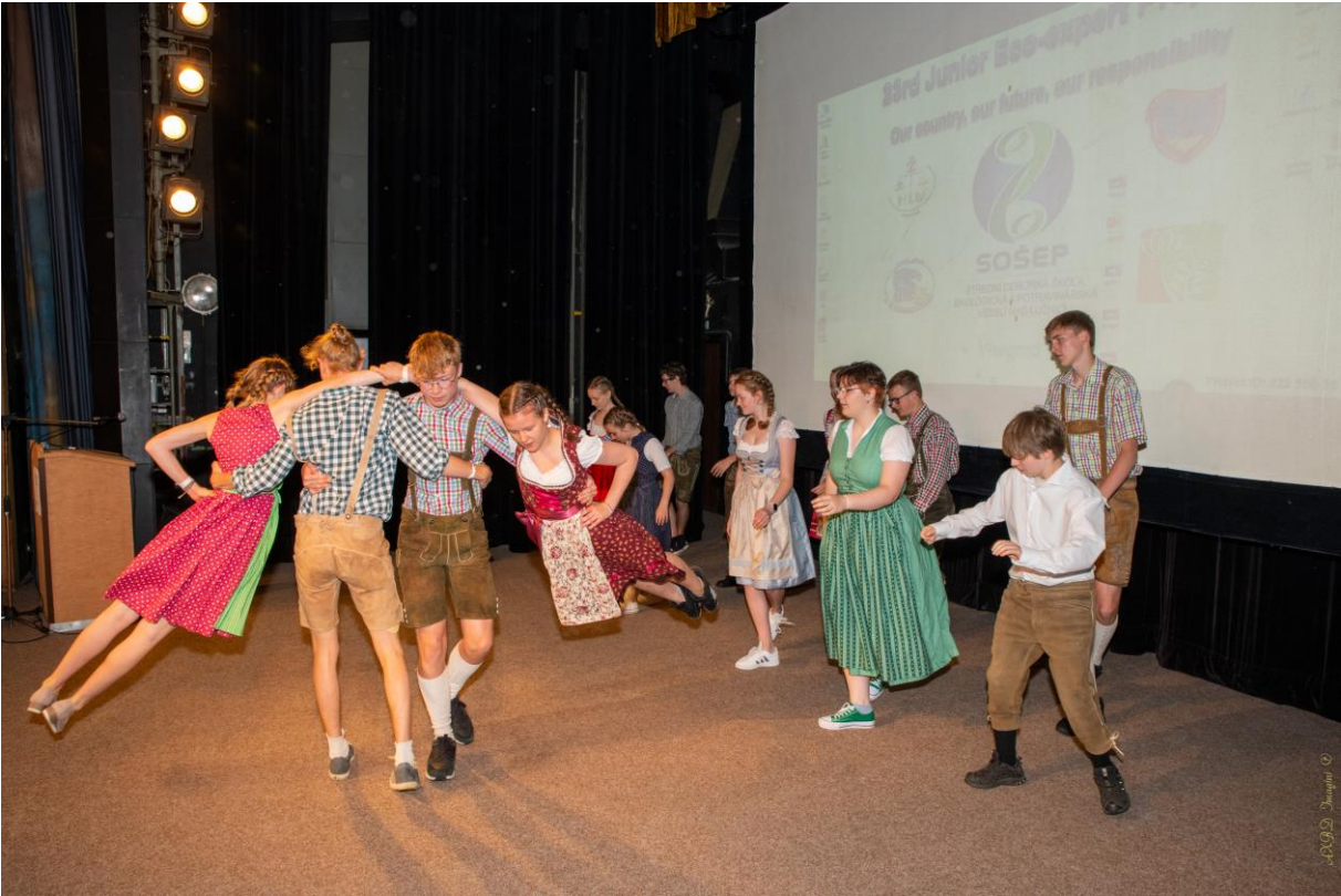
Austrian Cultural Performance