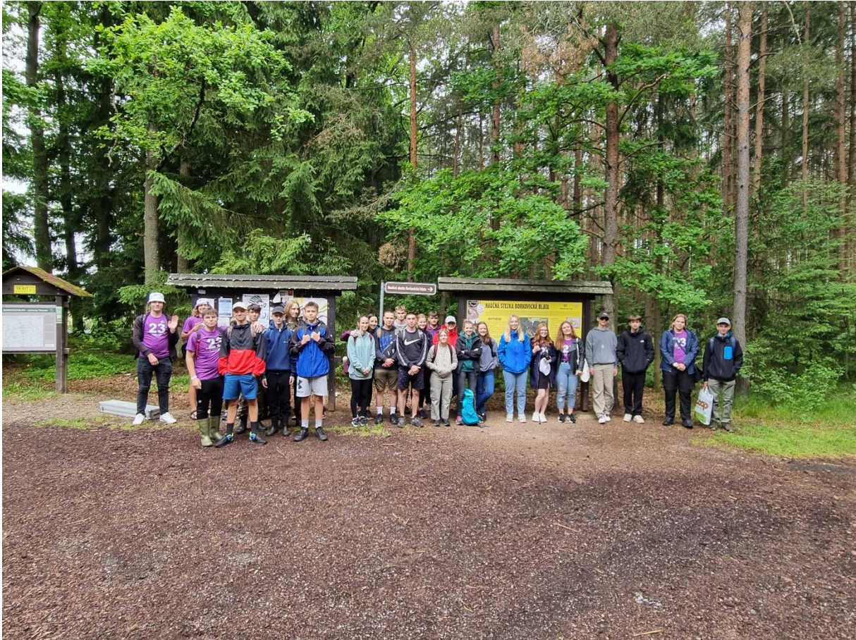
Borkovice moor 1

The groups 1,2,3 went to the Borkovice moor, to get acquainted with their history, flora, fauna and specific abiotic conditions. Furthermore, the students learnt about with the effects of wetlands on the landscape, their climatic function and the effects of man on the Borkovice moor, including climate change, as well as with the effects of peat extraction and subsequent reclamation. During the excursion, phytocenological monitoring of the area and sampling of peat and water took place.