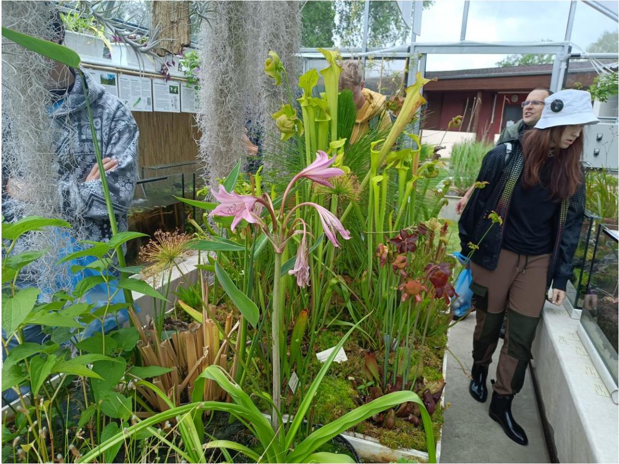
The Botanical Garden 2