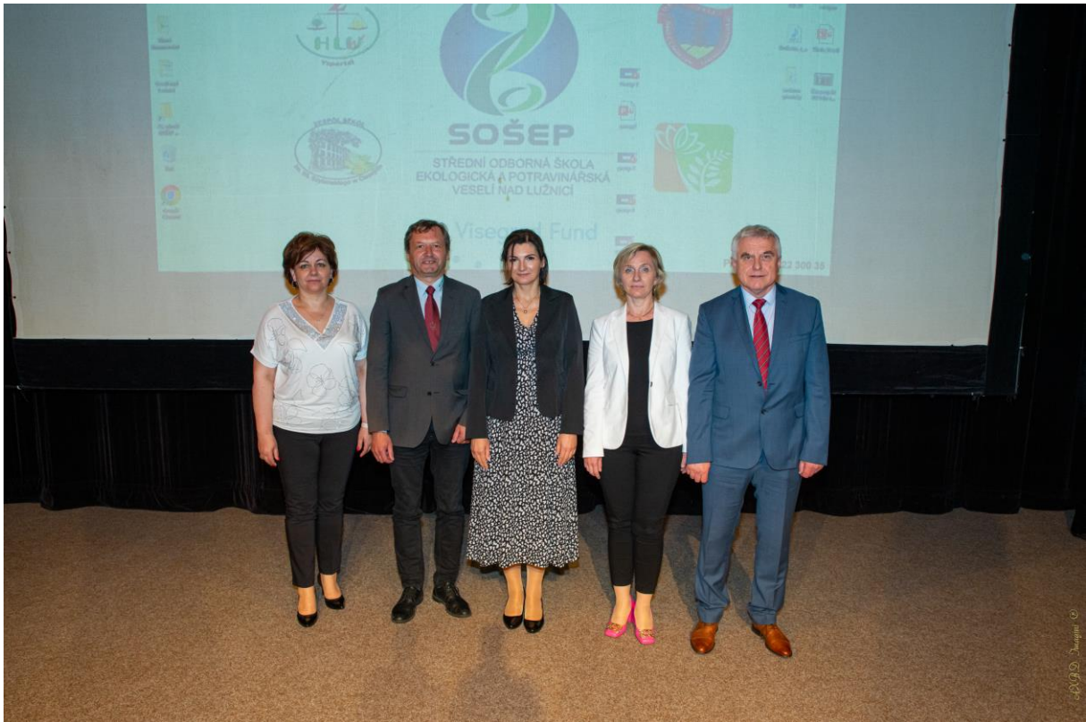
Headteachers of participants schools